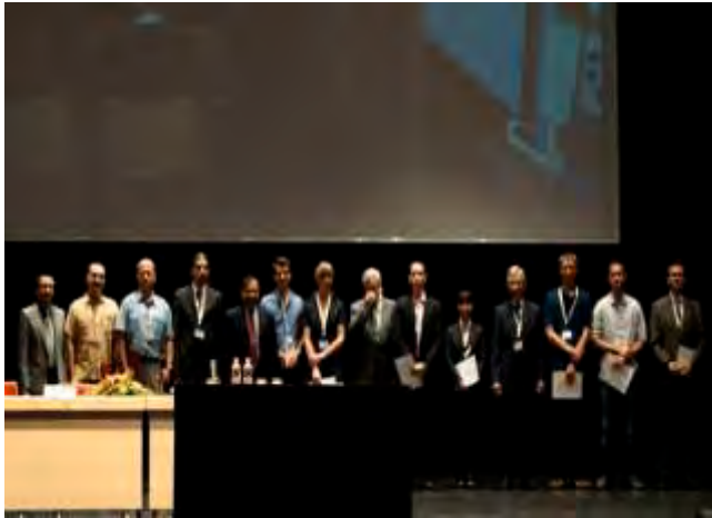
Fig.2 Young Investigator Award winners with IFMBE officers, committee members and conference chair.