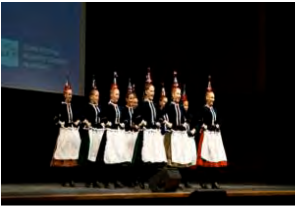
Fig.1 Folklore dance at the Opening Ceremony

The Conference was popular world-wide: paper submissions came from 60 countries. 4 keynote lectures were given: