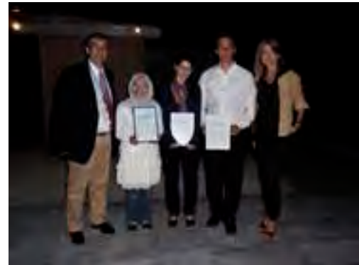
Fig.2 Best Student Papers were awarded in Mobihealth 2011