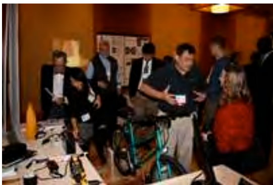
Fig3. Exhibiting booths and Prototype Displays

Sessions (Poster and presentations) were held addressing power, innovation, and disaster response. A panel was held on finding/developing funding resources and how entrepreneurship can play a role in bringing projects to successful completion.