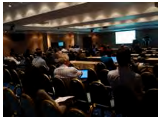
Fig.1 Conference of Mobile 2011

New research, applications and case studies were featured within the framework of MobiHealth 2011. A number of highly timely mobile communication systems that can be used for patient monitoring and healthcare delivery were presented, while a number of Information and Communication Technology (ICT) platforms were presented for chronic disease management and support of the ageing population. The field of wireless medical devices was also explored. Novel implantable and wearable sensory and monitoring devices were proposed, and the performance of protocols which are widely used for biomedical telemetry was examined. Mobile and wireless technologies for healthcare delivery and emergency, as well as ambient assistive technologies for pervasive healthcare services were also investigated.