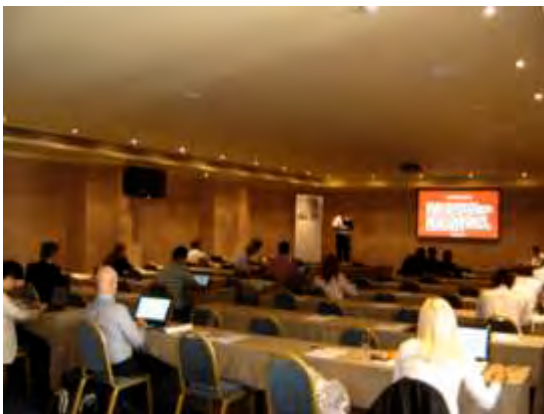
Fig.1 10th International Workshop on Biomedical Engineering