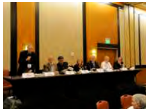
Fig1. What Works, What Doesn't Panel .

First day sessions (both poster and presentation) addressed Power, Agriculture, Water, Health, and Data Connectivity. Panels were held on topics What Works What Doesn't and Results from IEEE Humanitarian Technology projects.