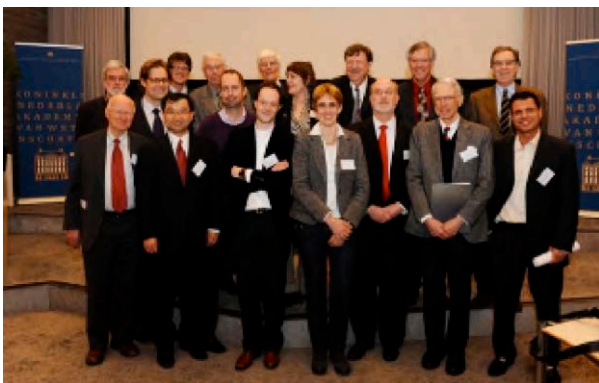
2010 Award winners