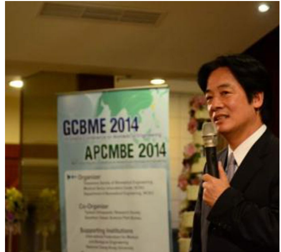
Welcome Reception_ Mayor Lai