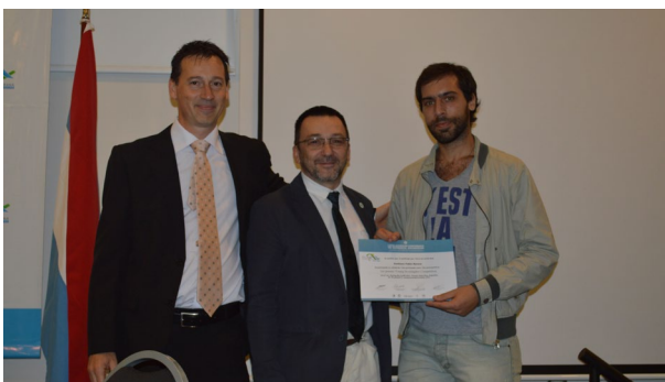
Fig. 11 – YIC for Biomedical Engineering – First Prize

This Committee evaluated the presentations in the oral and poster sessions.