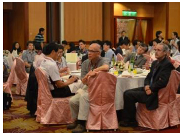
Banquet in Evergreen Plaza Hotel Tainan