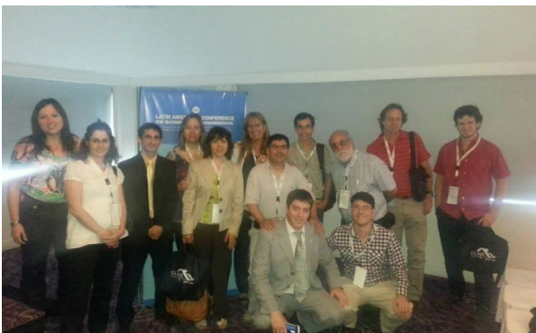
Fig. 14 – Rehabilitation Engineering Meeting

-Rehabilitation Engineering Meeting of SABI (see Fig. 12).