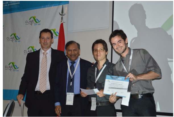
Fig. 12 – YIC for Biomedical Engineering – Second Prize