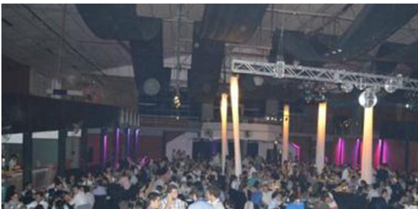
Fig. 19 – Gala Dinner

The gala dinner (see Fig. 19 & 20) was held in a building on the banks of the Paraná River.