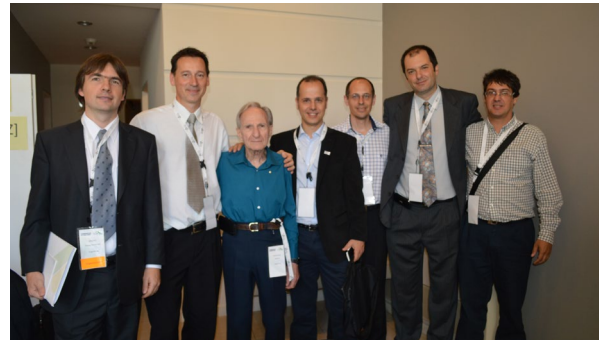
Fig. 22 – Organizing Committee Members

We congratulate all the committees, sponsors, institutions, participants, and individuals that helped to make the Conference so successful, and (see Fig. 22) send our best wishes to the organisers of the next CLAIB conference, which will be held in Bucaramanga, Colombia, in 2016.