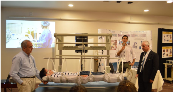
Fig. 18 – Commercial Exhibition

The gala dinner (see Fig. 19 & 20) was held in a building on the banks of the Paraná River.