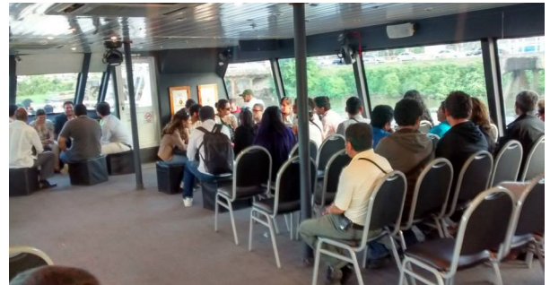
Fig. 21 – Boat trip (indoor)

After the closing ceremony delegates went on a Boat Trip on the Paraná River (see Fig. 21).