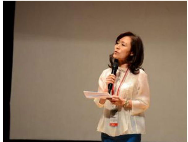
Opening Address_ Vice President of NCKU