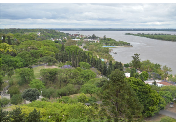
Fig. 3 – Paraná River from Convention Center

There were also 14 keynote talks delivered by distinguished international scientists as well as