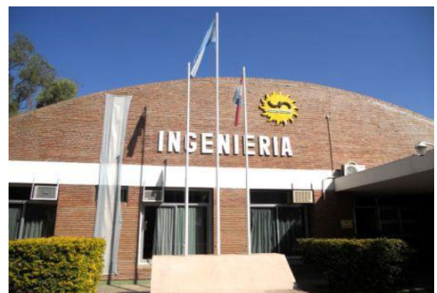
Fig. 4 – FI-UNER building

The courses were held in the FI-UNER building (see Fig. 4).