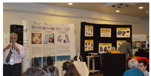
Fig. 17 – Commercial Exhibition