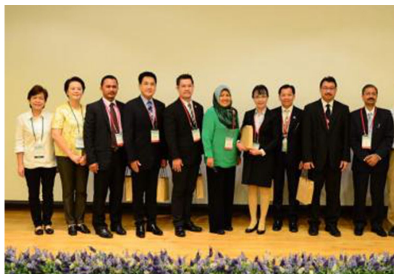
Symposium – Dental Devices and Healthcare