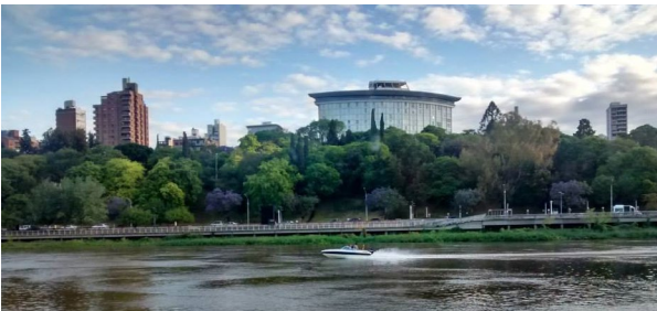
Fig. 2 – Convention Center from Paraná River