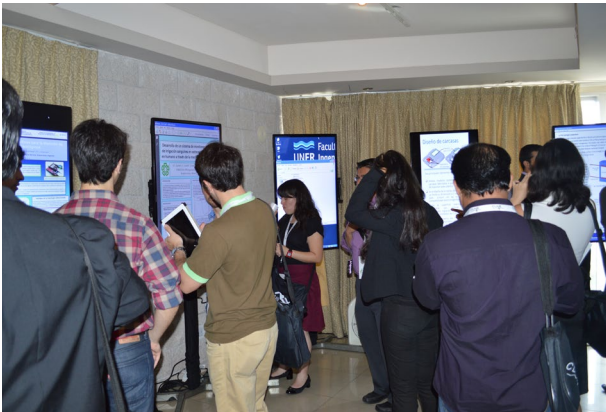
Fig. 5 – Electronic Poster Session

plenary and semi-plenary conferences, 26 oral sessions and 15 poster sessions (see Fig. 5).