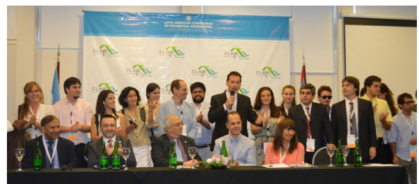
Fig.23 - Closing Ceremony. Organizing Committee and Authorities IEEE-EMBS, IFMBE, CORAL, FI-UNER and SABI