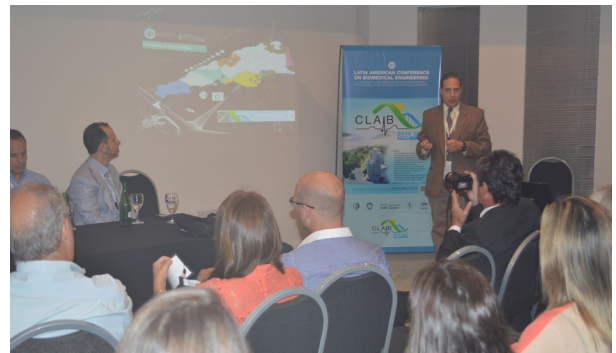
Fig. 15 – Presentation of Nuclear Medicine Center

-Panels of Professional Experiences (see Fig. 16) in which Clinical Engineers discussed cases related to their practice in their institutions (hospital, industry, etc.). Many of these panel members participated in the Commercial Exhibition (see Figs. 17 & 18).