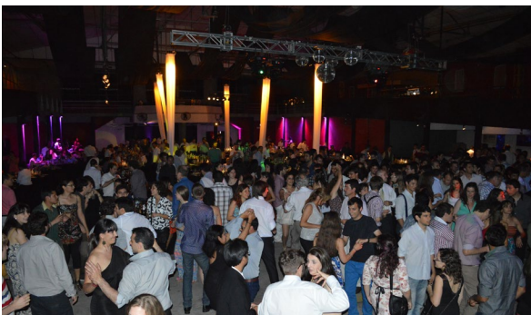
Fig. 20 – Gala Dinner