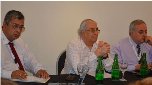
Fig. 7 – CORAL Meeting

conference several IFMBE and CORAL meetings took place (see Fig. 7).