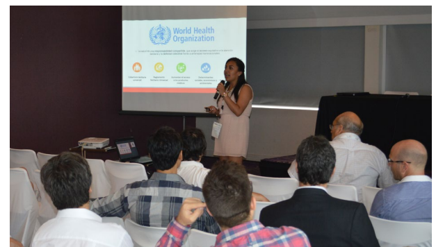
Fig. 16 – Panel of Professional Experiences