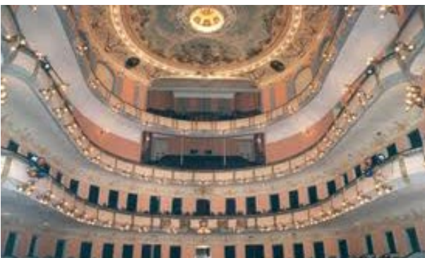
Fig. 8 – “3 de Febrero” Theater