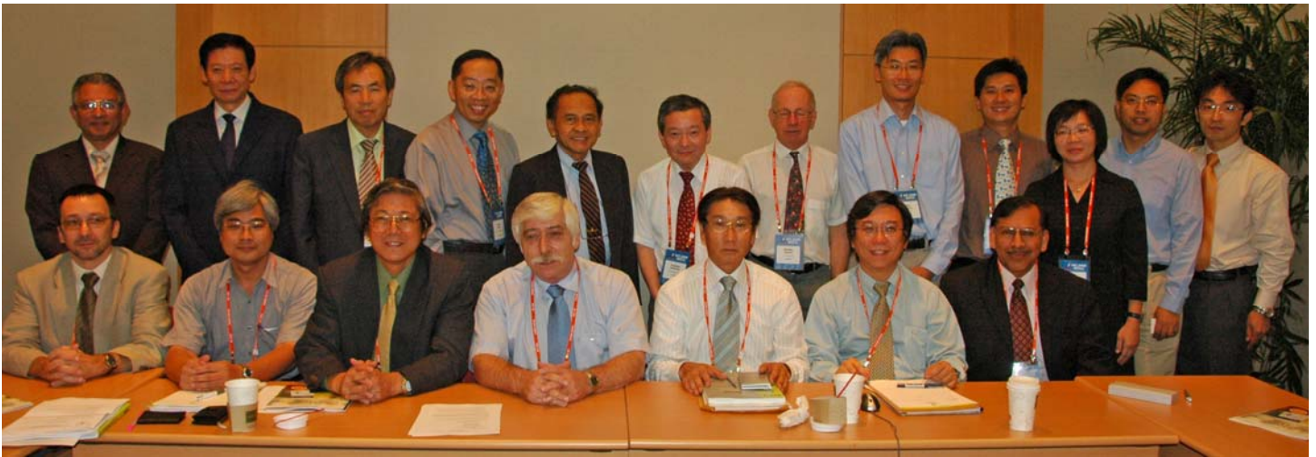
The IFMBE Asia-Pacific Working Group meeting with the Asia Pacific Travelling Fellows in Seoul, 28 Aug 2006