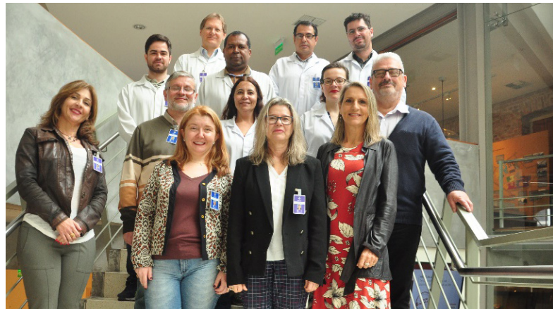
Clinical Engineering team of the Irmandade Santa Casa de Misericórdia de Porto Alegre Hospital - Brazil

In the last 4 years, working with the University Technology Center, our team has designed and developed 17 projects with 12 of them successfully concluded.