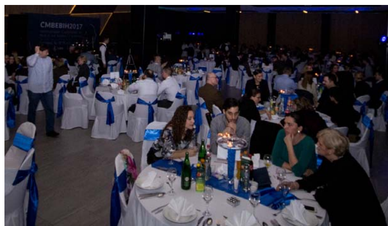
Conference gala dinner