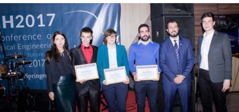
Students with Scholarships

The fifth workshop was organized by BH Future Foundation who provided scholarships to the best student applications in Bosnia and Herzegovina.