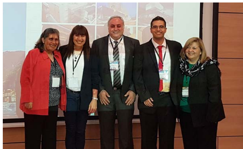
Academic Committee of the Summer School

Based on to the success of this First Summer School, the second joint International Summer School will be organized in Bogota, Colombia, from June 25 th – 30 th , 2018. This experience will be transferred to other Latin American countries.