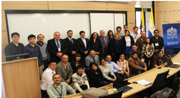
Speakers and students of the First Summer School “Emerging Technologies to Support Health Care and Independent Living” at Pontificia Universidad Javeriana