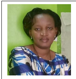
Nominee Photo (48 x 33 mm)

It is for this reason that I feel that I am a suitable candidate to serve in the Digital Health Division Board as a member of IFMBE