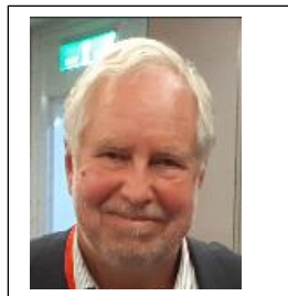
Nominee's Photo (recommended size (48 x 33 mm))

As an advocate of "open data", I will also contribute in linking the Division with other initiatives in the open data world and make sure biomedical engineers are present there and informed about the developments in other organizations that play important roles in the open data field.