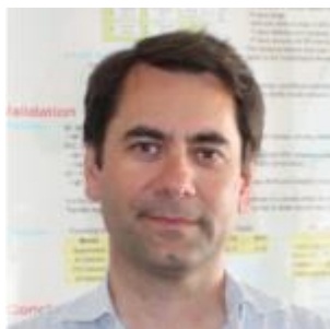
Nominee Photo (48 x 33 mm)

During my last term as interim coordinator of the Digital Health Division of the IFMBE we started several new activities, such as the regional conference series on Digital Health (i.e., IFMBE European Conference on Digital Health, IFMBE African Conference on Digital Health, IFMBE Asia-Pacific Conference on Digital Health, IFMBE Latin American Conference on Digital Health, IFMBE North American Conference on Digital Health), the Open Data repository ( https://dhd.ifmbe.org/open-data/ ) and the Webinar Series on Digital Health ( https://dhd.ifmbe.org/webinar-series/ ), while continuing multiple activities from the former Working Group on eHealth and Health Informatics of the IFMBE (e.g., the scientific challenge series that is being implemented in IFMBE conferences and the International Conference on Biomedical and Health Informatics). In this term we propose the consolidation of these activities while introducing a new line of activities with two main strategic dimensions: i) the involvement of students and student associations in Digital Health (e.g., through hackathons and networking sessions) and ii) the cooperation with medical organizations (e.g., faculties, societies) to increase awareness and adoption of digital health (e.g., through programs and courses on AI adoption in health).