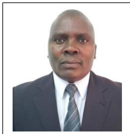
Nominee Photo (48 x 33 mm)

To enhance my capability to the high calling of this office, I will employ my wealth of experience, expertise, Skills, Knowledge, exposure & Network, teamwork, accountability, openness, honesty, leading by example among other traits within my potential Representing Africa.