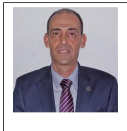
Nominee Photo (48 x 33 mm)

Committed to strengthening clinical engineering worldwide, I prioritize innovation, safety, and resilience in healthcare systems. As a SBEB-nominated candidate, I seek to leverage my multidisciplinary experience to drive IFMBE's mission, promoting international collaboration, advancing regulatory frameworks, and empowering emerging professionals in the field.